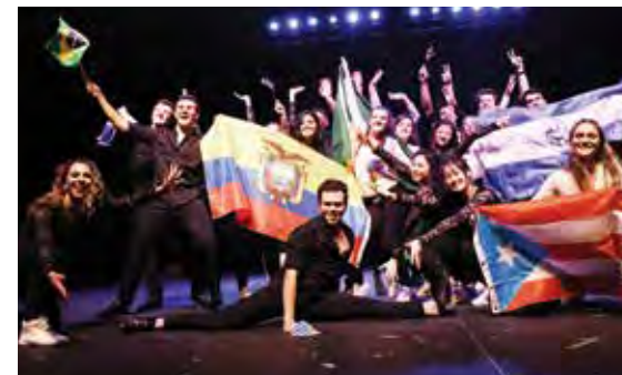
Students represented the countries of Latin America at i2i, which featured a lineup of creative and vibrant performances again this year.