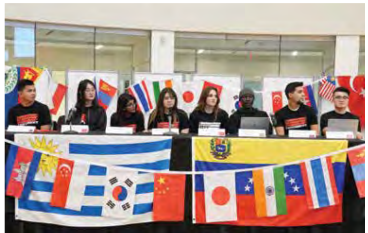
Student panelists share their stories and perspectives during Bryant's "I Am an Immigrant" panel held in the Academic Innovation Center forum on November 22, 2019.