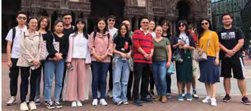
Newly enrolled graduate students from Bryant Zhuhai visit Boston during an ExtraMILE orientation program.