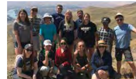
Workshop participants grouped at the edge of the Columbia River Plateau overlooking the towns of Lewiston and Clarkston in commemoration of Lewis and Clark.