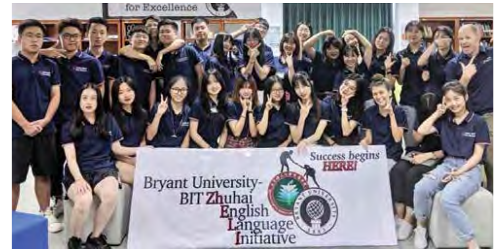
Bryant Zhuhai students and staff pictured at the Bryant Zhuhai Academic Center for Excellence.

better equipped to excel at the undergraduate level in an all English teaching-learning environment. For most of the Chinese students, this is a brand new skill set.