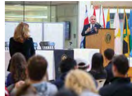
Rhode Island Senator Jack Reed answers questions during a Global Trade Forum organized by the Chafee Center for International Business.