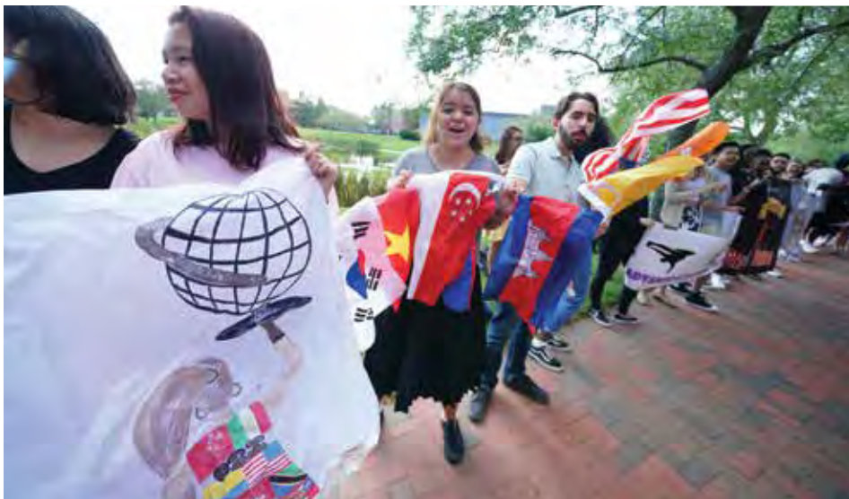
Members of the International Student Organization welcome the Class of 2023 during Convocation on September 4, 2019.