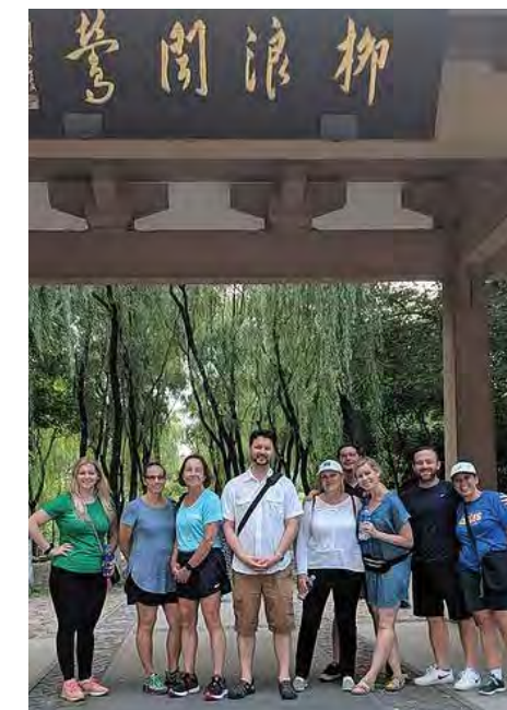
Participants spent a day exchanging ideas and exploring the Forbidden City in the heart of Beijing.

"Working for nearly ten years with the Greentown organization has been life changing. Our teachers have formed friendships and memories that will last beyond the program. Through our partnership, we have been able to develop our own teaching skills while also sharing our passion for teaching