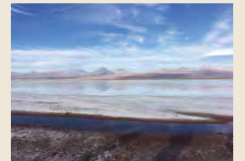
The best study abroad photo, as chosen by the Bryant community, is of the Atacama Desert in Chile.

The World Awaits! was held in the fireside lounge at the Fisher Student Center. Everyone who stopped by voted for their favorite study abroad photo and could apply for a passport. Students could also learn about opportunities for international experiences offered at Bryant including study abroad, Sophomore International Experience, and internationally focused events on campus.