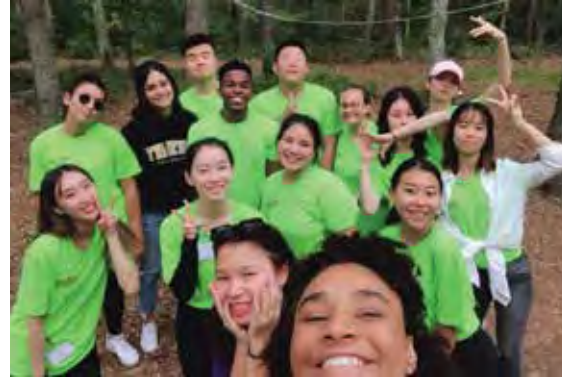
Students build new networks and engage in team building during this year's 4MILE program.