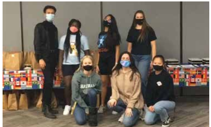
International Education Week offered more than 16 programs and events, including late night programming that offered opportunities for community members to expand their cultural competency.