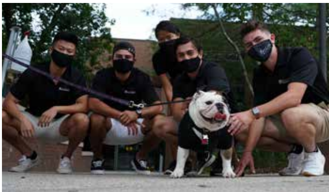
The team at Residential Life has helped make the transition back to campus easy for students, especially the many international students who returned early to complete the required 14-day quarantine period.