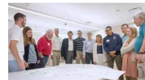
The Bryant ACE Internationalization Laboratory will develop strategies that integrate international programs into the priorities identified through Vision 2030, Bryant's strategic plan. It will strengthen these emerging pillars established through Vision 2020.

and advisors with University leadership and stakeholders. An internationalization review process for current programs will carry on into the summer and a peer-review process is scheduled for fall 2022, followed by a final report due from ACE in early 2023.