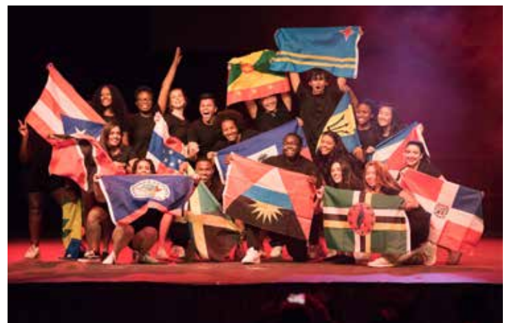
Students gathered on stage after the annual izi performance. The cultural dance show, led by the International Student Organization, was themed around community this year and raised cultural awareness on campus.