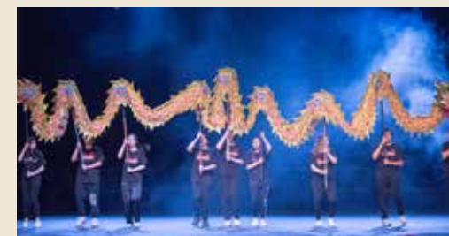
The Bryant University Dragon Dance Team spans the stage at izi with their signature dragon and performance.