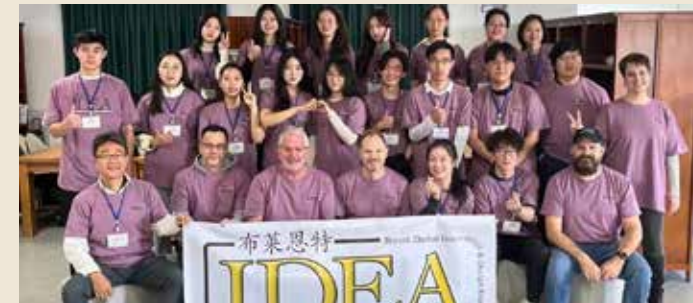
Faculty members at Bryant Zhuhai and students in the Bryant Zhuhai Class of 2025 during that campus's IDEA Program, held in December.